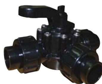
3 way 25/32mm valve threaded with half unions.