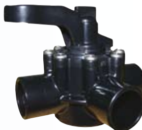
3 way 25/32mm slip fit valve