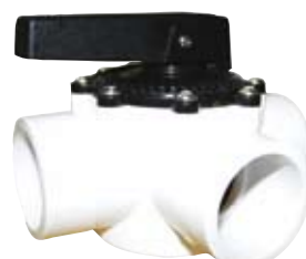
3 way 40/50mm slip fit valve