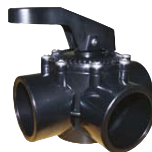
3 way 50/65mm slip fit valve