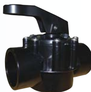
2 way 50/65mm slip fit valve