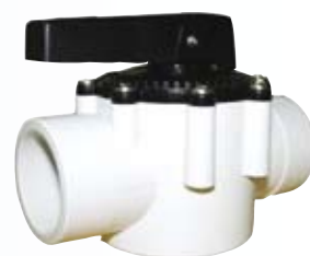
2 way 40/50mm slip fit valve

FPI valves are covered by a 12 month warranty against faulty materials and workmanship.